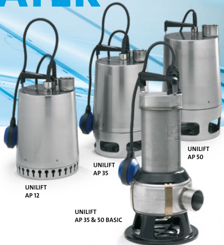
UNILIFT AP 12